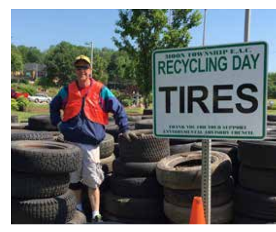
Electronics Recycling Days

Saturdays: April 7, August 4, October 6 10:00 a.m. – 2:00 p.m. Municipal Building